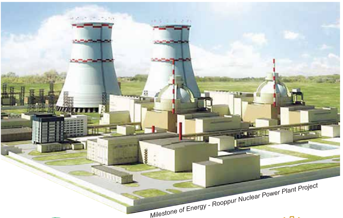
Milestone of Energy - Rooppur Nuclear Power Plant Project