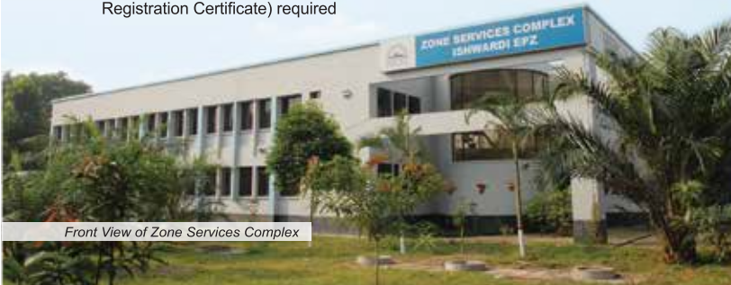
Front View of Zone Services Complex