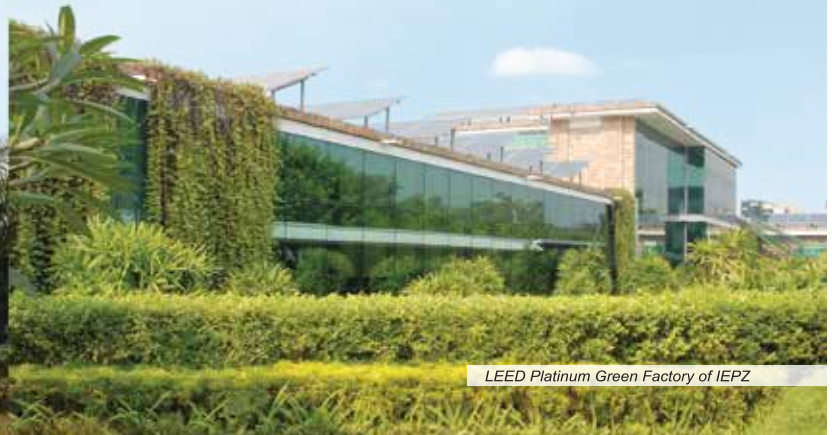
LEED Platinum Green Factory of IEPZ