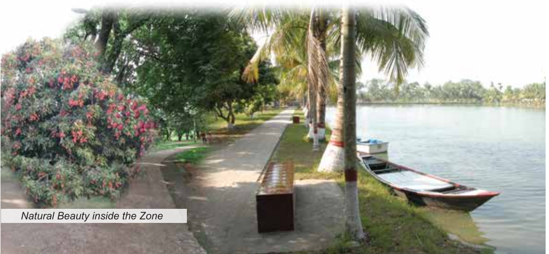
Natural Beauty inside the Zone

BEPZA Complex : H # 19/D, R # 6, Dhanmondi, Dhaka-1205, Ph: 880-2-9670530, 9675489, 9614332, 9613461, PABX: 9613467, 9613459, Fax: 880-2-9661849, 9673020, 9665545, E-mail: info@bepza.gov.bd, chairman@bepza.gov.bd, member.ip@bepza.gov.bd, gm.ip@bepza.gov.bd, gm.pr@bepza.gov.bd, Website: www.bepza.gov.bd