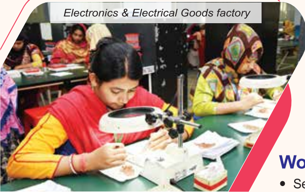
Electronics & Electrical Goods factory