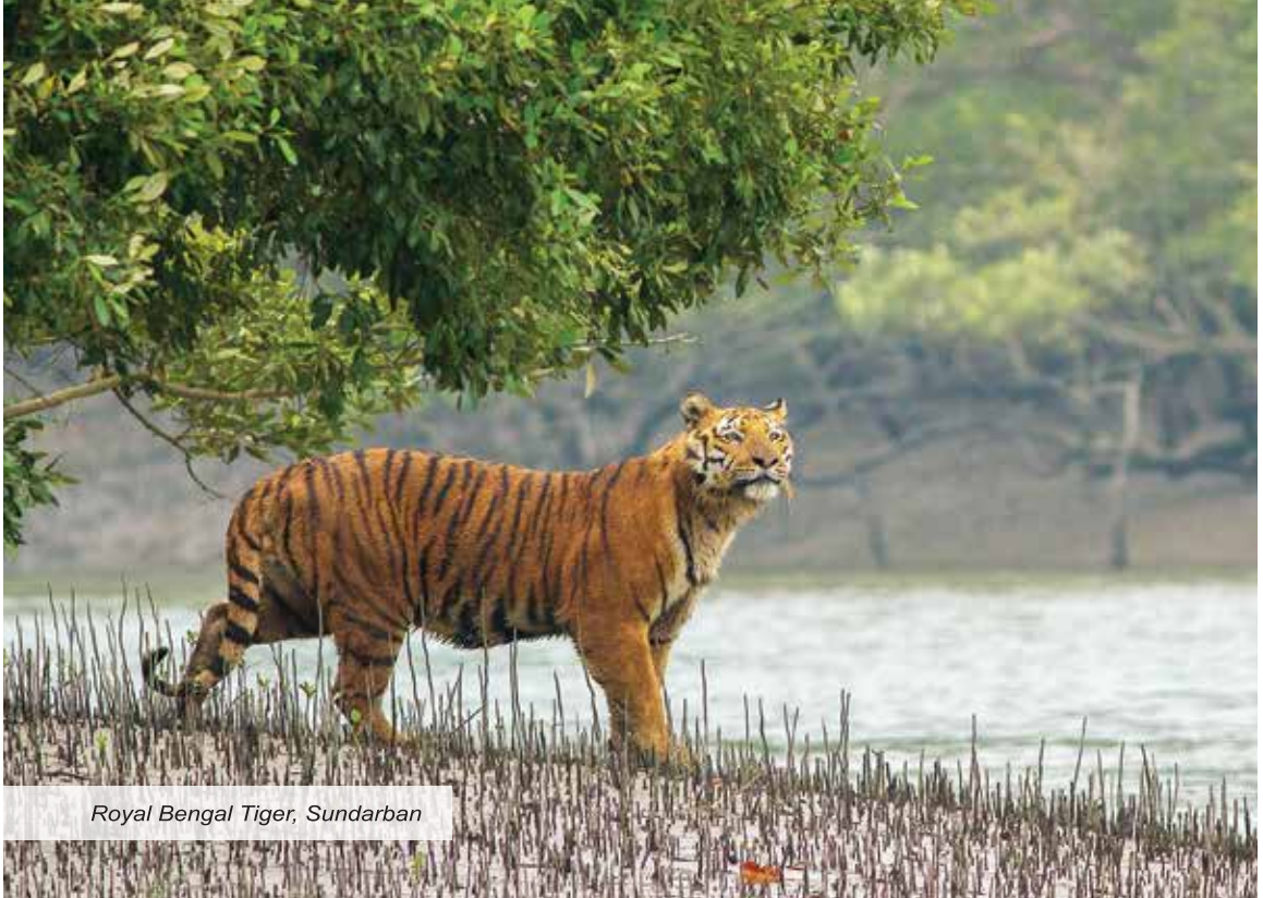
Royal Bengal Tiger, Sundarban