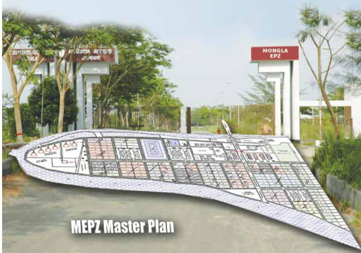
MEPZ Master Plan

Standard Factory Buildings 7 Nos (58,588.35 sqm)