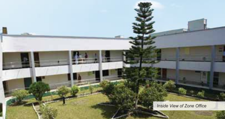
Inside View of Zone Office