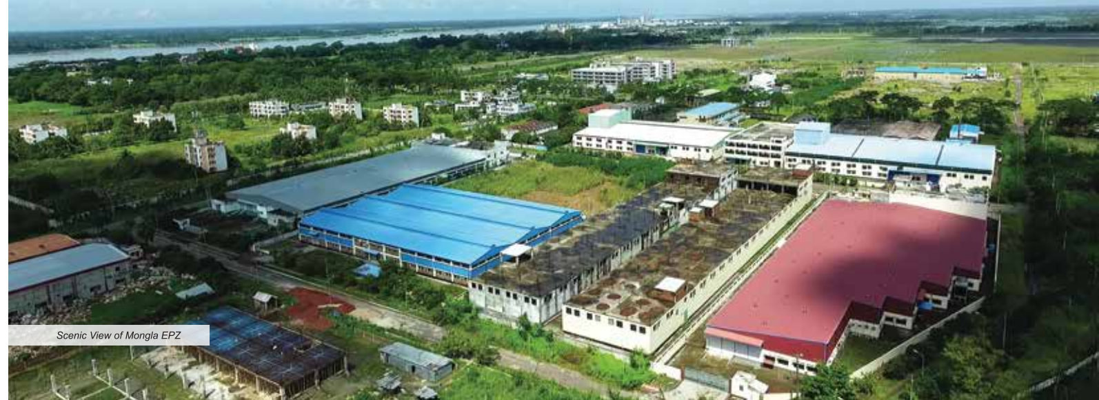
Scenic View of Mongla EPZ

The New Economic Lighthouse of the Southern Region