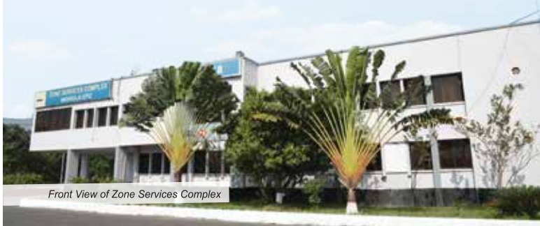
Front View of Zone Services Complex