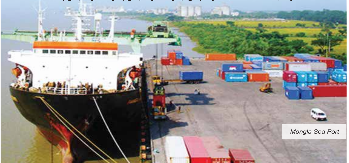
Mongla Sea Port

BEPZA Complex : H # 19/D, R # 6, Dhanmondi, Dhaka-1205, Ph: 880-2-9670530, 9675489, 9614332, 9613461, PABX: 9613467, 9613459, Fax: 880-2-9661849, 9673020, 9665545, E-mail: info@bepza.gov.bd, chairman@bepza.gov.bd, member.ip@bepza.gov.bd, gm.ip@bepza.gov.bd, gm.pr@bepza.gov.bd, Website: www.bepza.gov.bd